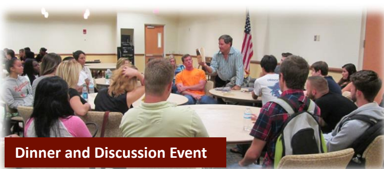
Dinner and Discussion Event